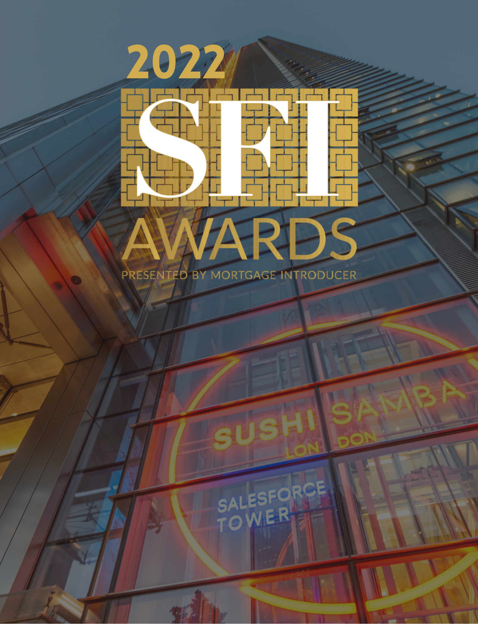
12PM - 4PM | FRIDAY 8 JULY 2022 | SUSHI SAMBA, THE CITY